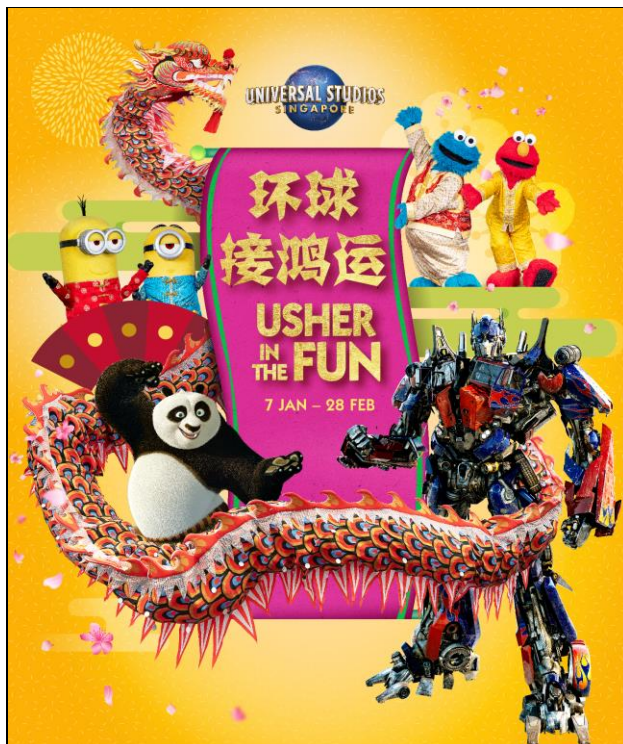
Elevate the Chinese New Year celebration by visiting with beloved characters, including Po from DreamWorks Animations' Kung Fu Panda films.

Usher in the Fun at Universal Studios Singapore with beloved characters including Po from DreamWorks blockbuster Kung Fu Panda films and receive bountiful blessings at S.E.A. Aquarium's Spring in the Sea