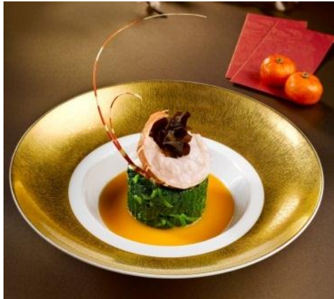
Poached Seasonal Green with Black Fungus in Lobster Bisque 龙虾云耳浸时蔬 $88 (small) / $132 (medium) / $178 (large) per portion