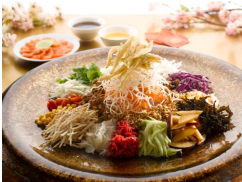
Salmon Fruity Vegetable Yu Sheng 发财三文鱼捞生