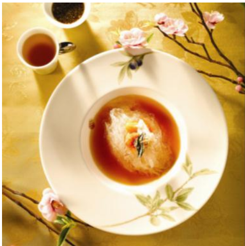
Braised superlative Imperial Bird's Nest with Crabmeat and Crab roe

(All set lunch and set dinner menus come with the Salmon Fruity Vegetable Yu Sheng)