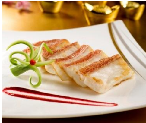
Pan-Seared East Star Group Fillet with Organic Beetroot Sauce 有机红菜头汁煎东星斑球 $38 (small) / $56 (medium) / $76 (large) per portion