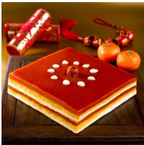
Layered Cake with Custard & Golden Flakes 金箔奶皇千层糕 $48 per portion

On top of the wide variety of delectable Yu Shengs, Feng Shui Inn is also introducing set menus and ala-carte menu that are available during lunch and dinner. One of the new celebratory dish guests can look forward is the Poached Seasonal Green with Black Fungus in Lobster Bisque . This festive dish, which specially uses lobster as it symbolizes the beginning of a smooth and prosperous year, sees a 'Live' lobster poached in a flavourful bisque.