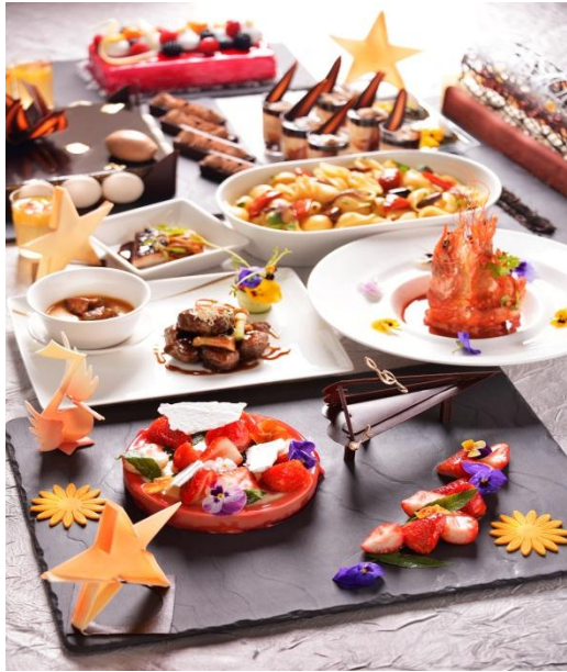
Starz Buffet Spread

Prepare yourself for a gastronomical feast this Chinese New Year with our all-Starz buffet menu that is sure to delight your taste buds.