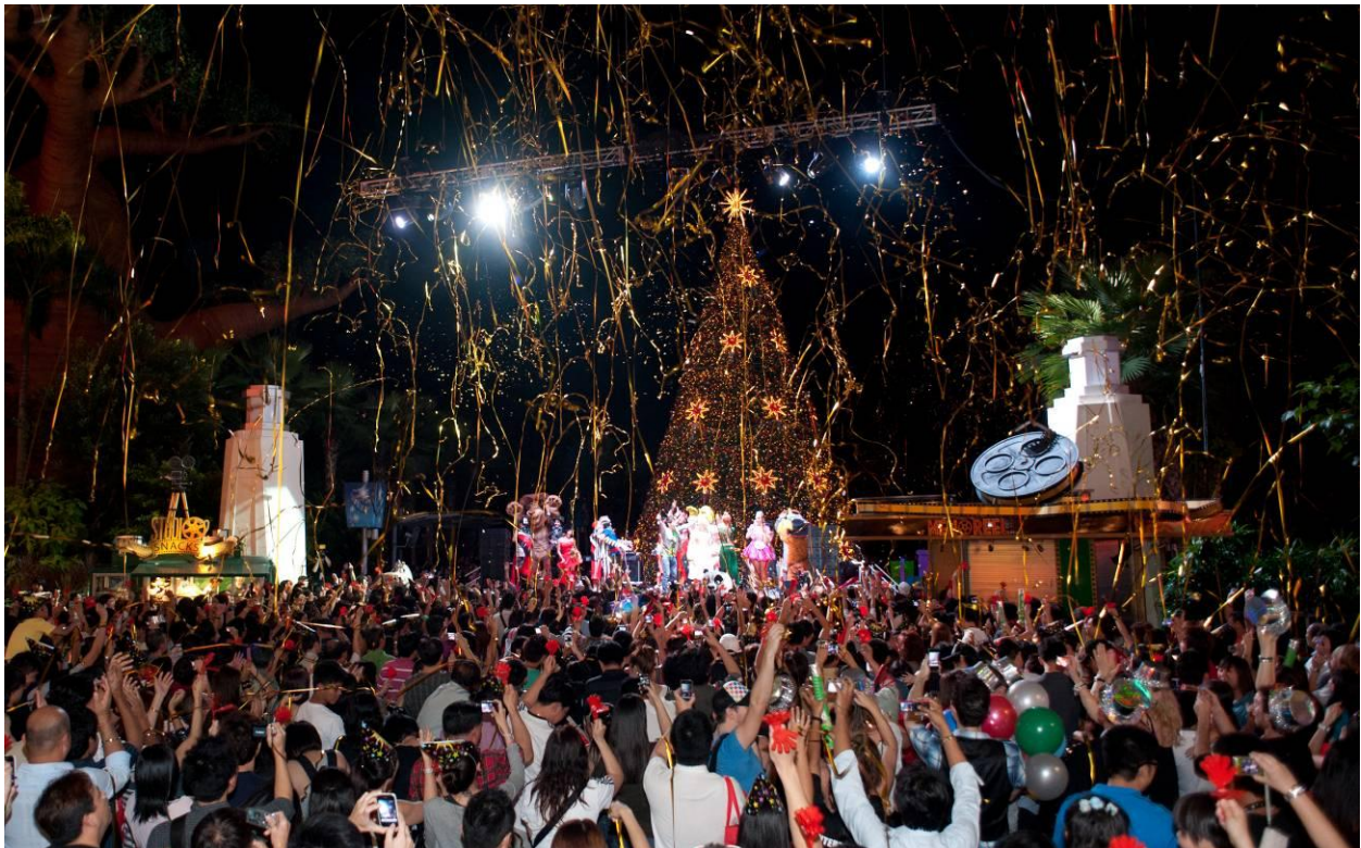
Usher in 2012 with the whole family at Universal Studios Singapore, Resorts World Sentosa.